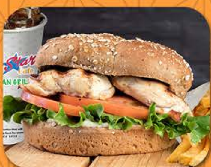
CHICKEN BREAST SANDWICH