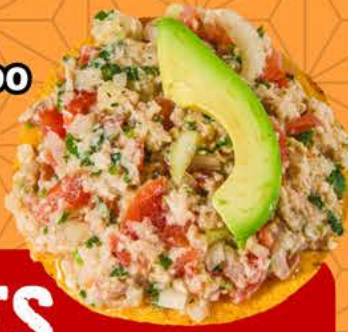
TOSTADA DE PESCADO