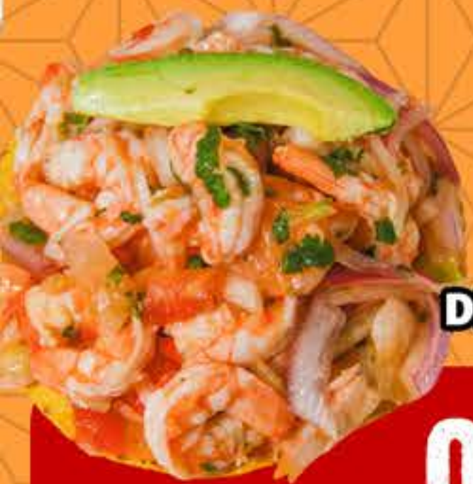
TOSTADA DE CAMARON